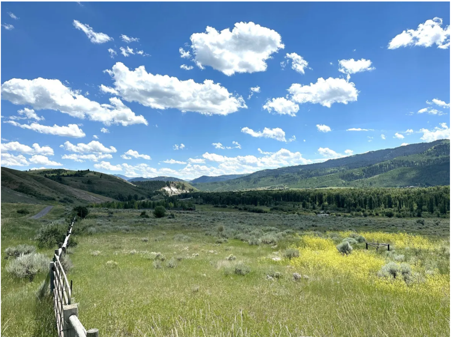
The project location is on WY 89, across the road from the Trash Transfer Station, Jackson Hole Gun Club and just north of the Old West Cabins.

JACKSON, Wyo. — The Wyoming Game and Fish Department (WGFD) hopes to break ground on a new employee housing project in August, the agency announced in a press release issued Tuesday.