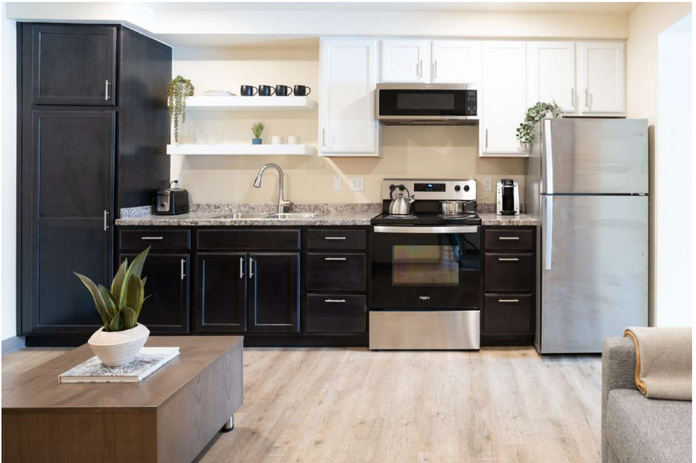
Kitchen in a 'Levinski Lodge A' apartment.

Published 5 days ago on March 16, 2023 Posted By Jack Reaney