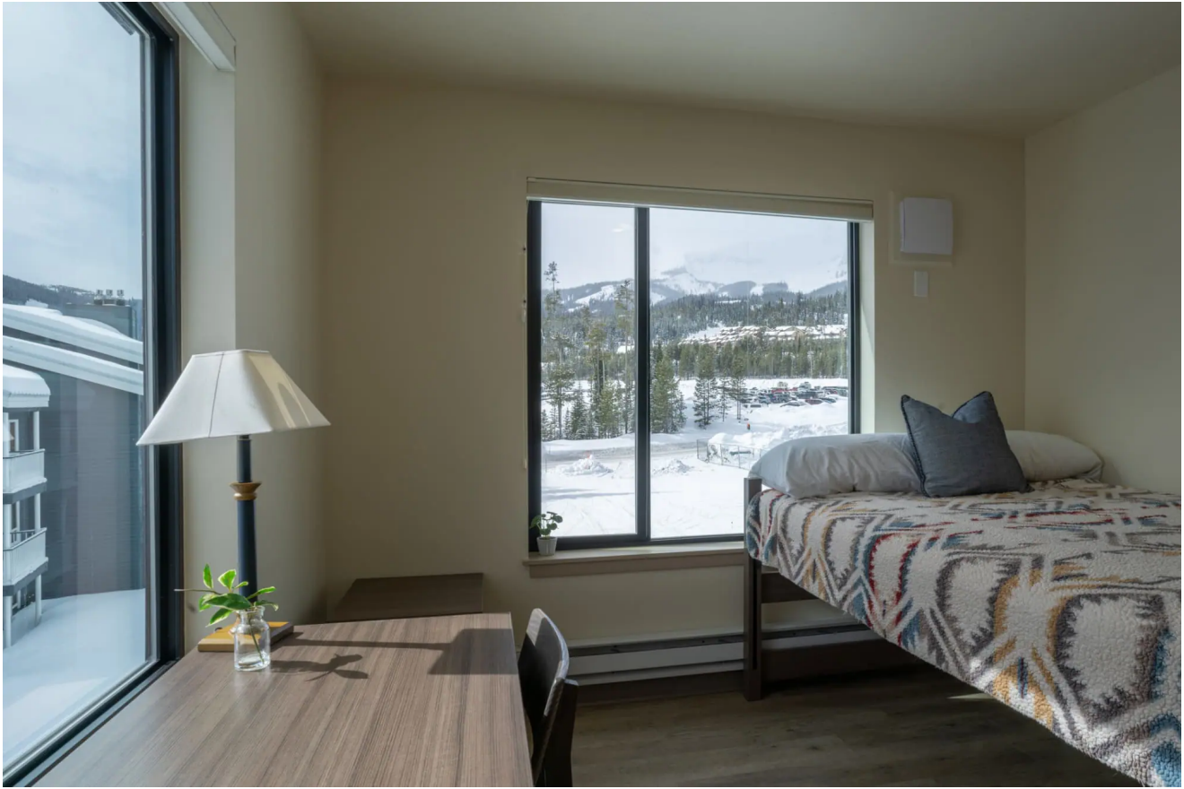
A look inside Big Sky's employee housing.