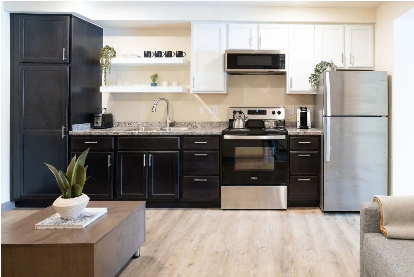
A look inside Big Sky's employee housing.

Working and living at a ski resort may be a dream job for people who love skiing or riding and want to be close to the mountain. Most ski resorts offer their employees discounts and benefits such as free season passes, discounts on food and drinks, discounts on purchases of merchandise, and a bunch more. However, most mountain employees are just looking for a nice place to stay while working at the resort.