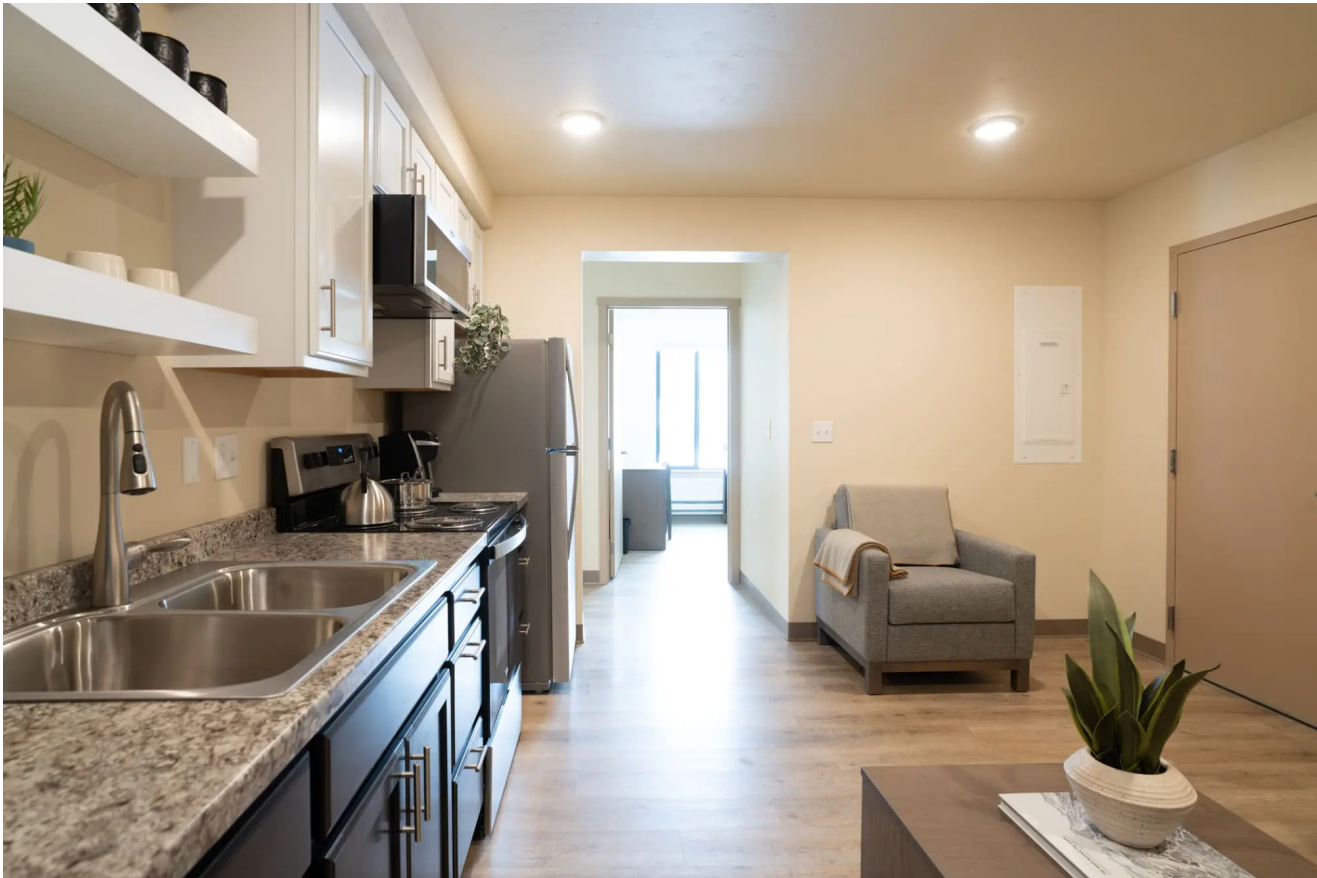
A look inside Big Sky's employee housing.