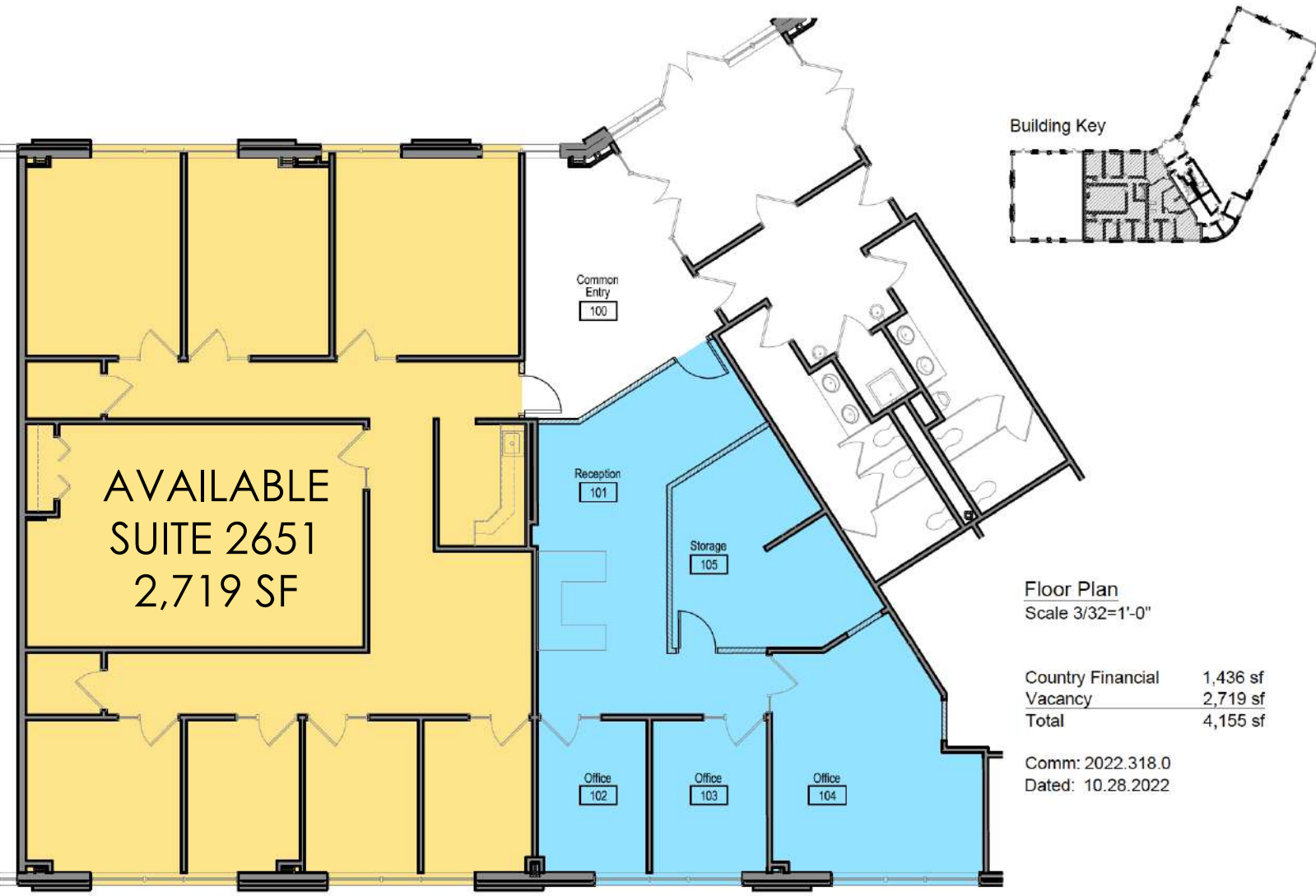
Floor Plan Scale 3/32=1'-0"