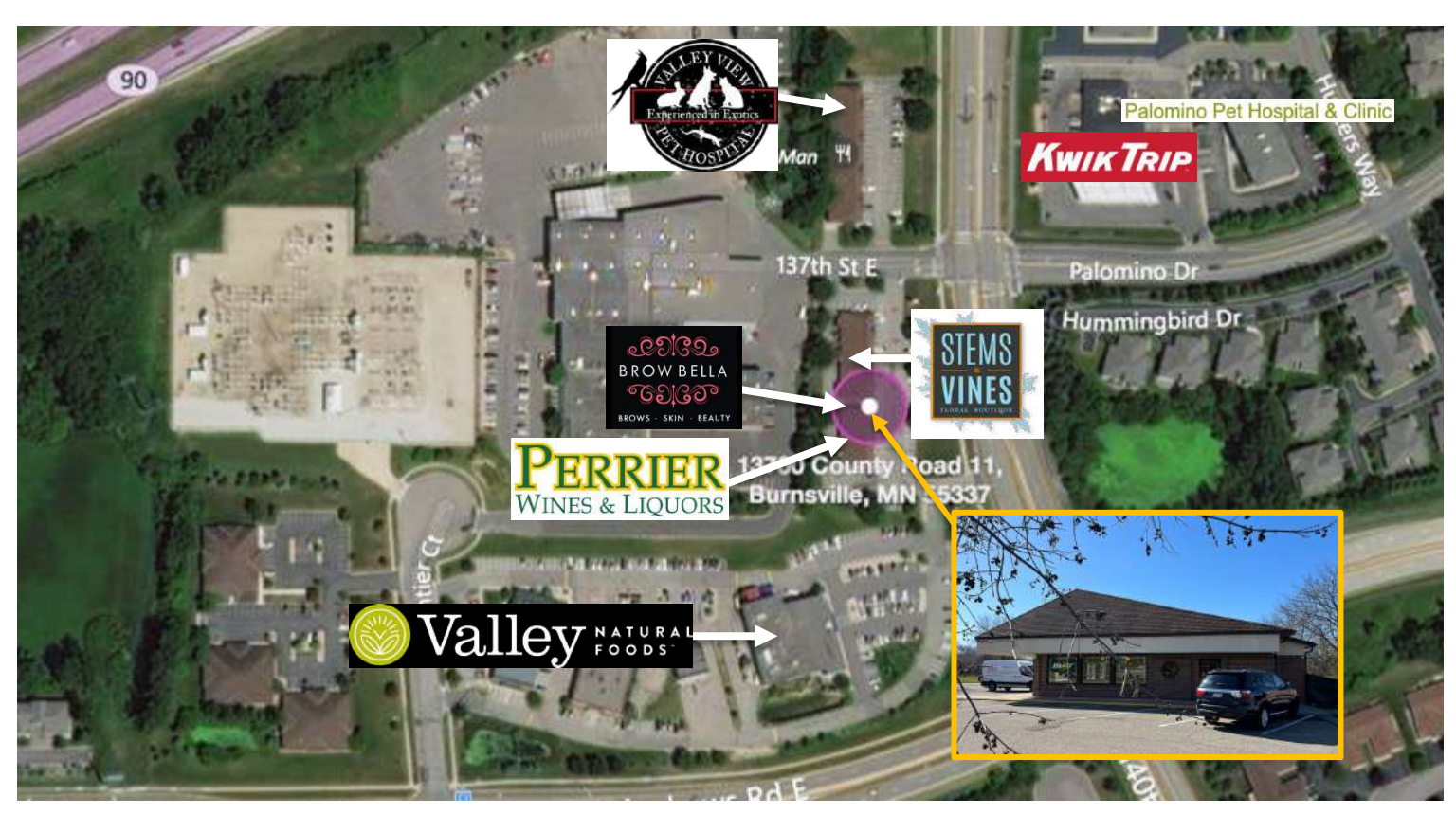
This information is accurate as of the date of printing and is subject to change without notice. All information is deemed accurate, but cannot be guaranteed.