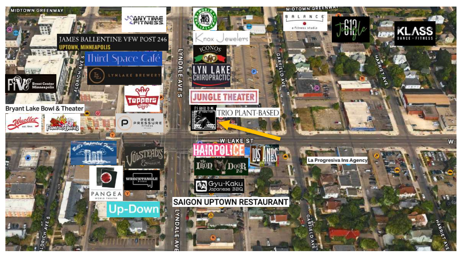
This information is accurate as of the date of printing and is subject to change without notice. All information is deemed accurate, but cannot be guaranteed.