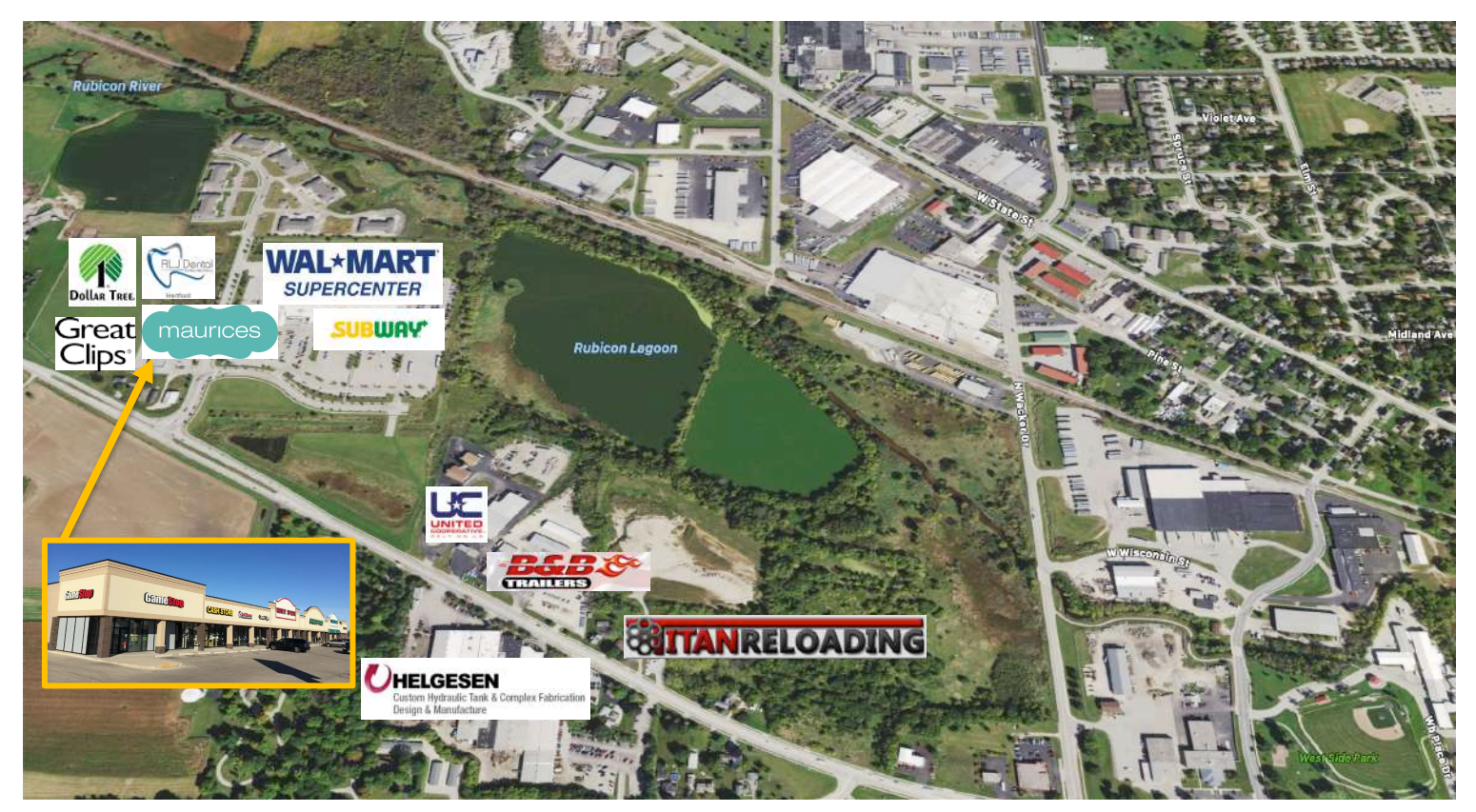
This information is accurate as of the date of printing and is subject to change without notice. All information is deemed accurate, but cannot be guaranteed.