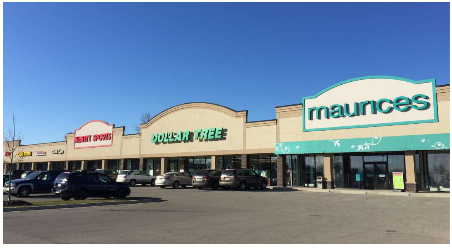
This information is accurate as of the date of printing and is subject to change without notice. All information is deemed accurate, but cannot be guaranteed.