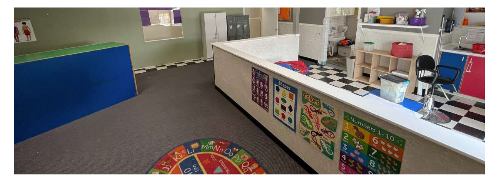
This information is accurate as of the date of printing and is subject to change without notice. All information is deemed accurate, but cannot be guaranteed.